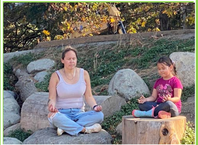
ÁLENENEĆ- Learning from our homeland program

Our program will model WSÁNEĆ disciplines and values to foster respected families.