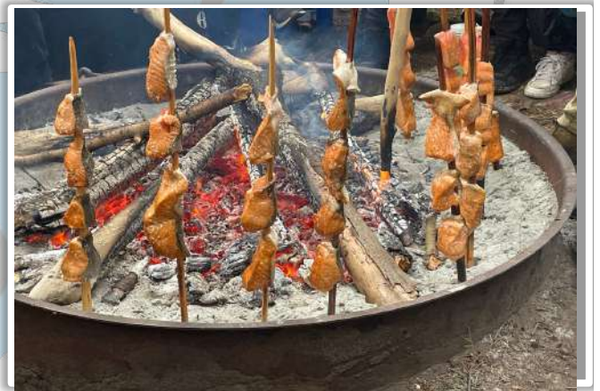
ÁLENEŃEĆ- Learning from our homeland program