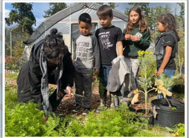
PEPAKEN,ÁUTW -Blossoming house indigenous plants program

Our program will model WSÁNEĆ disciplines and values to foster respected families.