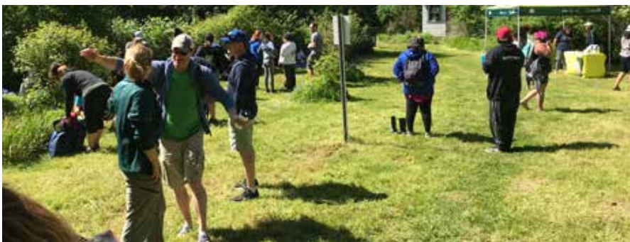
Russell Island field trip