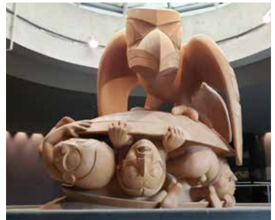
Science World and Museum of Anthropology, Vancouver